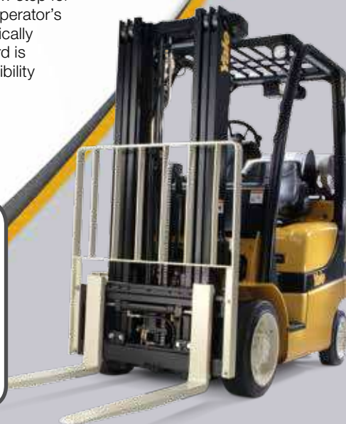
Truck shown with optional equipment