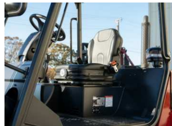
Adjustable Black Vinyl Mechanical Suspension Seat. Adjustable Weight Range to 370 lbs