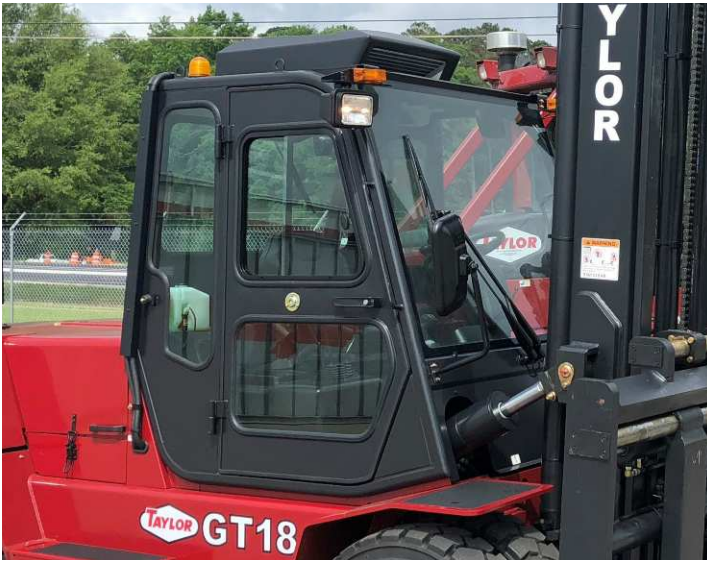
Optional Fully Enclosed & Partial Cabs Available