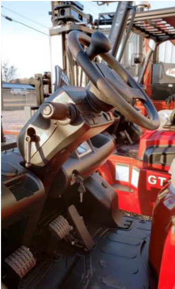
Adjustable Steering Column Pivots 30 Degrees