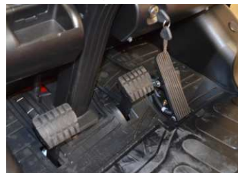
Two Pedal Hydraulic Inching & Brake and Moulded Rubber Floormat