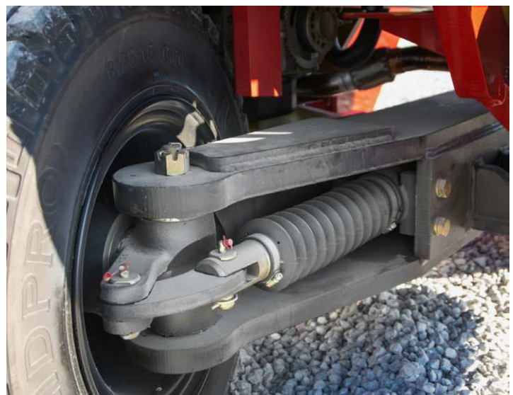
Heavy Duty Steer Axle Mounted on Rubber Isolators. Toughest Steer Axle Profile Available