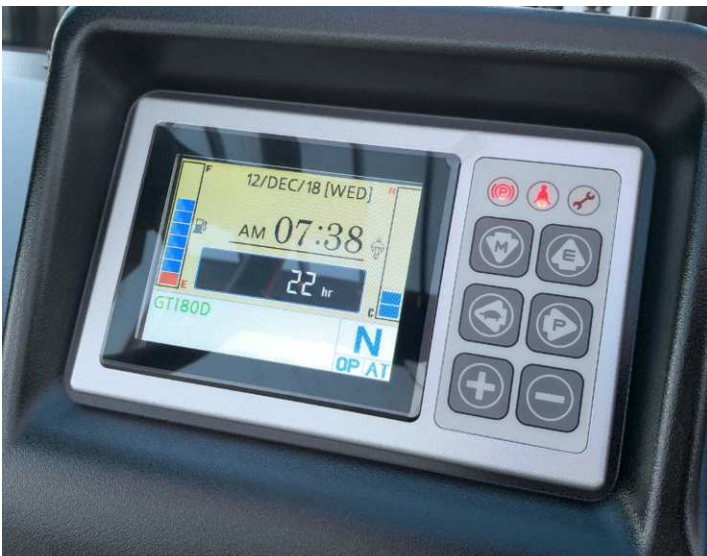
Weather Sealed High Visibility LCD Diagnostic Display Includes Fault Code Storage and is Password Protected

Taylor Machine Works was founded on the promise of meeting our customer's needs. The sign on our original facility in 1927 stated "We Engineer and Build What You Need" and those ideals still ring true today! From multiple Mast, Carriage and Fork configurations to Special Attachments that are unique to your business, we will step forward to meet the challenge. With hundreds of options readily available for our trucks, and the ability to custom engineer any other need that arises, Taylor Machine Works is here ready to serve.