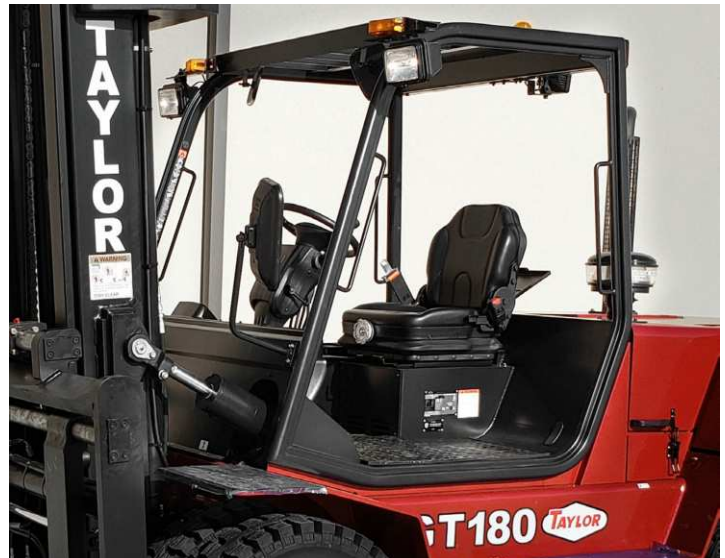
Isolation Mounted Open Operator Base with Overhead Guard