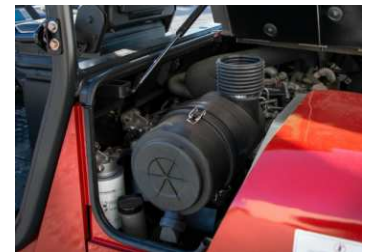
Donaldson Air Cleaner with Safety Element