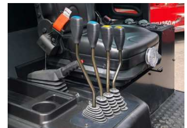
Hydraulic Control Levers and Ratchet Style Hand Brake