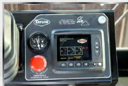
Easy to understand diagnostic display. TICS (Taylor Integrated Control System) using CANbus technology is standard on the TX Series.