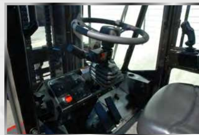
Spacious uncluttered cab with tilt steering, hinge-down dash, climate controls and adjustable seating Premium vinyl or cloth seat that rotates 15° left and 20° right