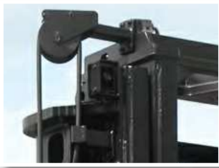
Forward activated alarm