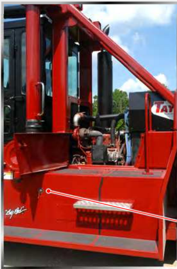
Battery cut-off switch