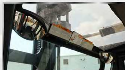
Dual panoramic interior rear view mirrors standard Dual external side view mirrors standard Optional pedestrian camera and monitor