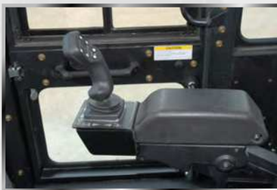
Comfortable adjustable arm rest with fingertip joystick control for smooth precise handling