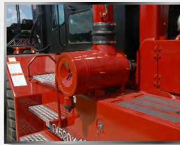
Dual element air cleaner with restriction indicator