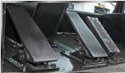
Two brake pedals left – brakes and inching right – brakes only

This blend of ergonomics and technology will help your operator be more efficient with the job at hand... handling materials.