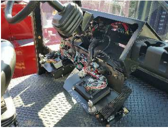
Flip-down Dash with Color/Number Coded Wiring (Standard)

Taylor Lift Trucks are designed with ease of maintenance and serviceability as a key priority. With today's engine and emissions requirements, daily maintenance checks and timely periodic service are the key to your equipment's longevity. All daily checks across the Taylor product line can be accessed from the ground or running board, ensuring that operators can complete these requirements with ease. Also, the sliding hood (on rollers), side service doors and removable floor panels open to expose the drive train and hydraulics to provide easy access for service and inspection.