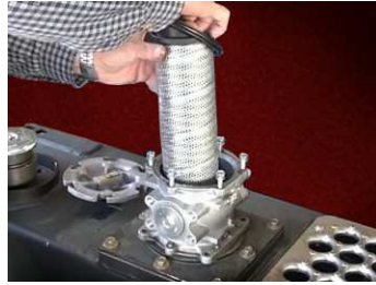
Spin-on Breather, Wire Mesh Strainer & Replaceable Internal Element (Standard)