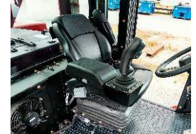
Fully Adjustable Air Ride Seat (Standard)