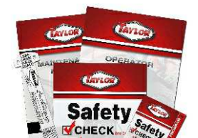
Vehicle Information Package (Standard)