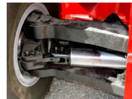
Industry's Toughest Steer Axle (Standard)