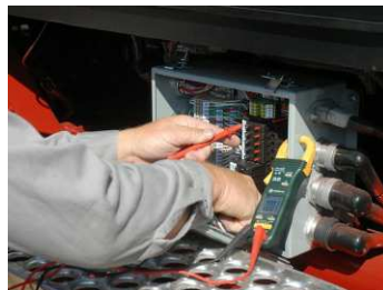
Heavy Duty Circuit Breakers/Reset Switches (Standard)