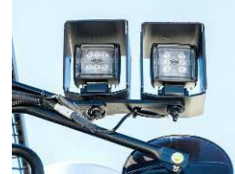
8 LED Work Lights (Standard)