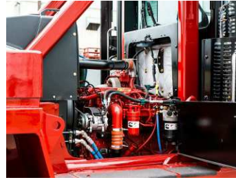
Easy Access to Drive Train & Hydraulics