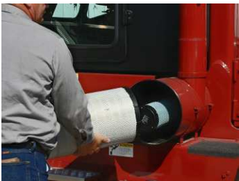
Donaldson Air Cleaner with Safety Element (Standard)