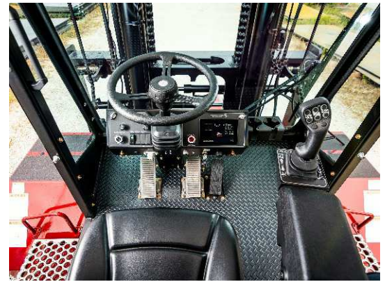
Fully Enclosed 2-door Cab - All Steel - 32,000 BTU Heater (Standard)