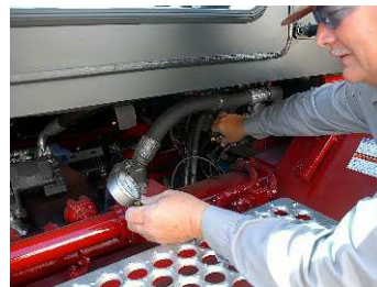
Service & Inspection from Ground Level