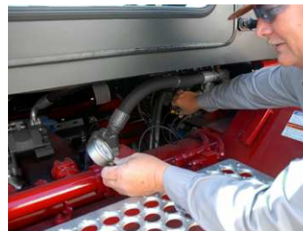
Service & Inspection from Ground Level