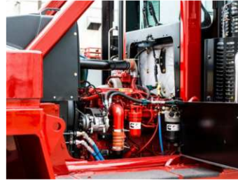
Easy Access to Drive Train & Hydraulics