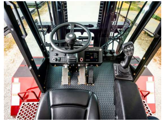
Fully Enclosed 2-Door Cab with Multiple Climate Control Configurations Available (featured cab is shown with available options)