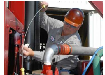
Easily Accessible Daily Checks