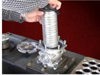
Spin-on Breather, Wire Mesh Strainer & Replaceable Internal Element (Standard)