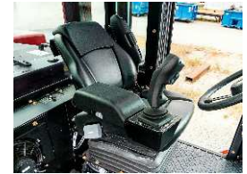
Fully Adjustable Air Ride Seat (Standard)