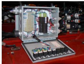
Heavy Duty Circuit Breakers/Reset Switches (Standard)