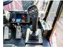
11 Button Command Joystick (Standard)