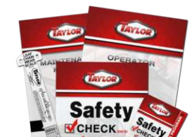
Vehicle Information Package (Standard)