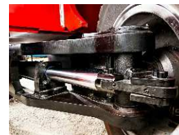
Industry's Toughest Steer Axle (Standard)