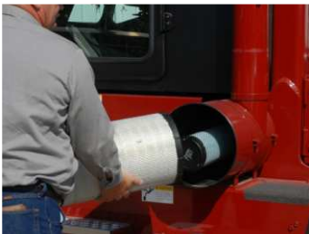
Donaldson Air Cleaner with Safety Element (Standard)