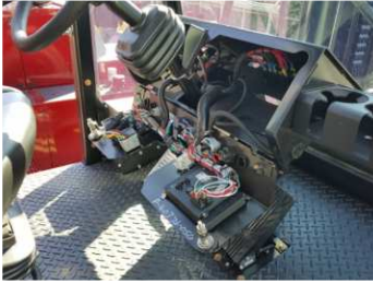
Flip-down Dash with Color/Number Coded Wiring (Standard)

Taylor Lift Trucks are designed with ease of maintenance and serviceability as a key priority. With today's engine and emissions requirements, daily maintenance checks and timely periodic service are the key to your equipment's longevity. All daily checks across the Taylor product line can be accessed from the ground or running board, ensuring that operators can complete these requirements with ease. Also, the sliding hood (on rollers), side service doors and removable floor panels open to expose the drive train and hydraulics to provide easy access for service and inspection.