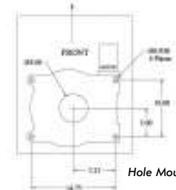
Hole Mounting Detail

*Specifications may change without notification. Copyright © 2003 Stellar Industries, Inc.