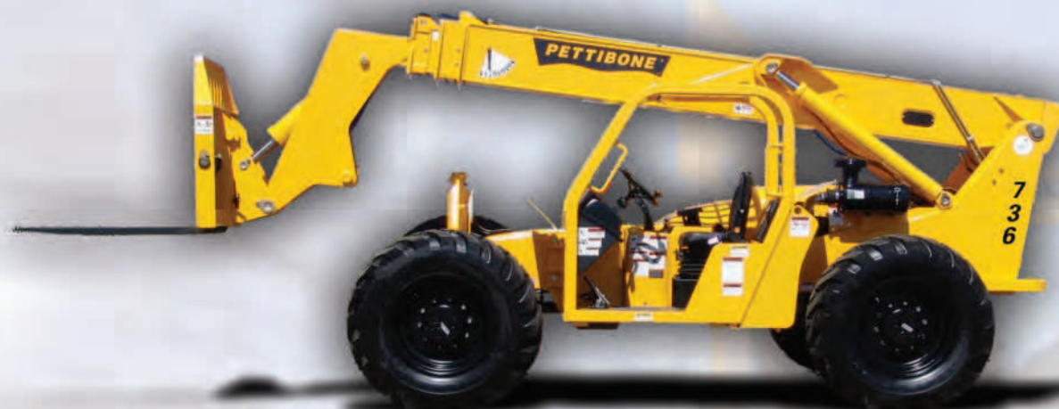
STANDARD FORK FRAME REACH