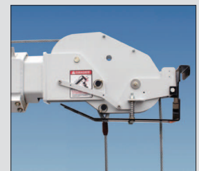
Low Profile Position