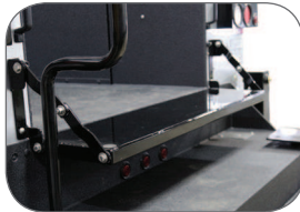
1/8 inch aluminum double panel tailgate with hinged arm brackets to provide a stout working surface.