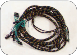
Encased in a nylon braided loom, the standard electrical wiring harness used by Stellar covers all functions, and features the use of weather-tight connectors. Wiring is labeled every 6 inches for identification

• Every Stellar mechanic service body features our Torq-Isolator crane support design and isolates the crane compartment from the rest of the side pack. Lifting stresses are transferred to the stabilizers and box-type subframe, not the compartment doors.