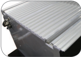
Side pack tops utilize the Stellar exclusive extruded aluminum top. It has two accessory mounting rails to eliminate drilling and makes mounting and relocating accessories easy and secure.