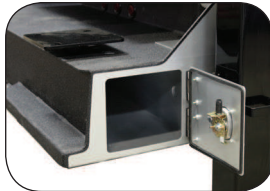
Full width longbar storage compartment integrated into the rear workbench bumper. Removable vise pedestal is standard.