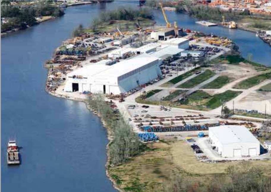
Oil States Skagit SMATCO's 185,000 square foot manufacturing, engineering, sales and service facility with waterfront access.