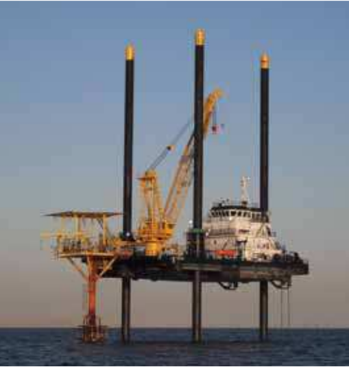
The Nautilus® model 1100L-120 lattice-boom crane now makes lifts once reserved for derrick barges.