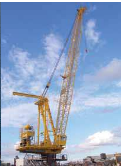
Nautilus® Model 1400L.5-170 in pre-testing for the East Area Project offshore Nigeria.