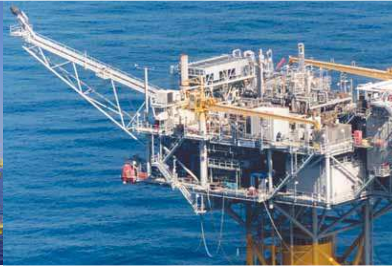
Nautilus® box-boom cranes on the Allegheny TLP in the Gulf of Mexico.