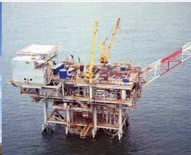
Nautilus® cranes on a platform in the Gulf of Mexico.