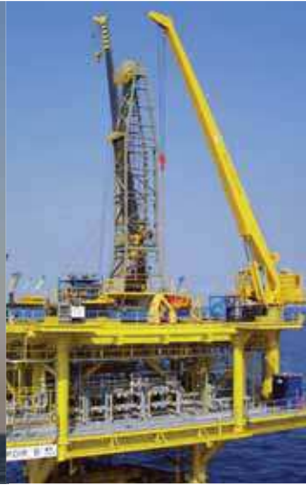
Nautilus® model 340B-80 manufactured for the West Espoir project offshore West Africa.