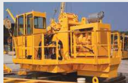
Oil States Houma rebuilds and refurbishes all brands and models of hydraulic marine cranes.