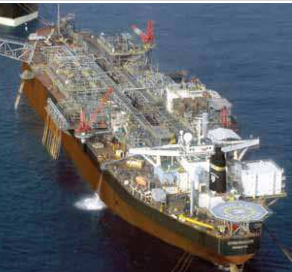
Three Nautilus® lattice-boom cranes on the FPSO Zafiro Producer off the coast of West Africa.