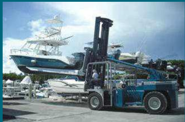
M2800 - Florida, USA