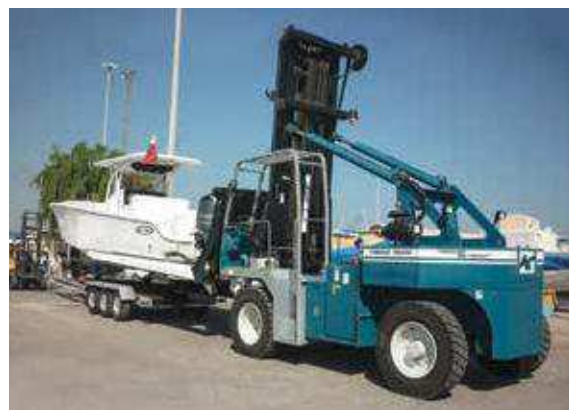
M2500 - Doha, Qatar