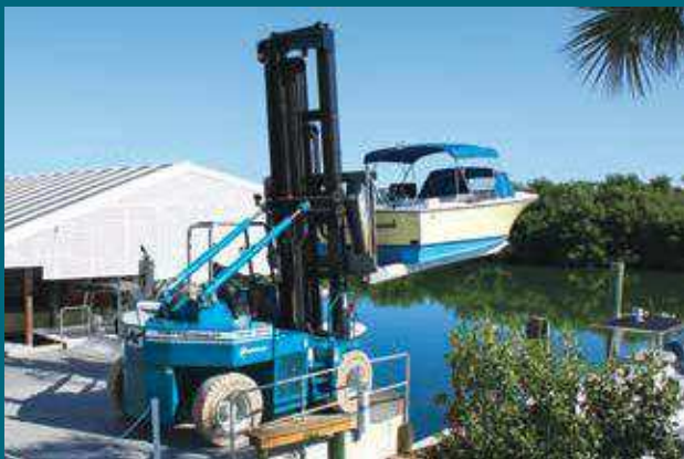
M2000S - Florida, USA