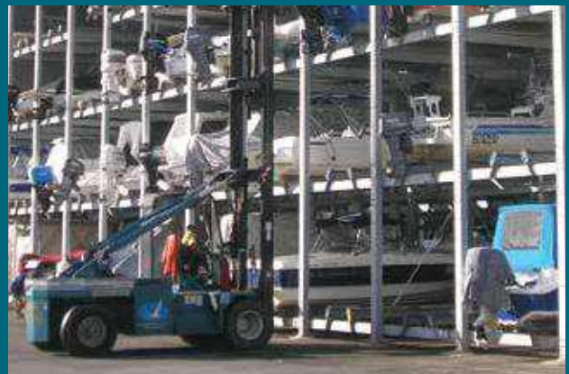
M2000 - Queensland, Australia