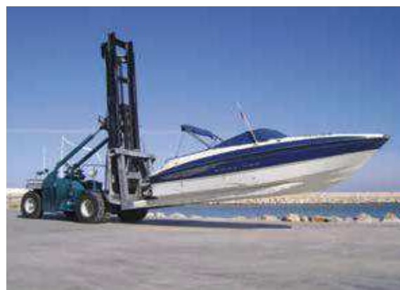
M2000 - Denia, Spain