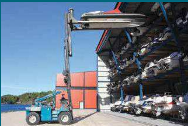
M1500 - Kragero, Norway

*Greater lifting heights will result in lower lifting capacities. See the load charts on model specification sheets.