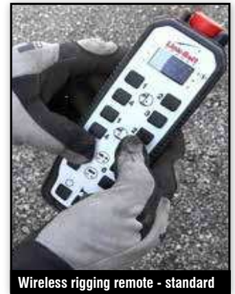
Wireless rigging remote - standard