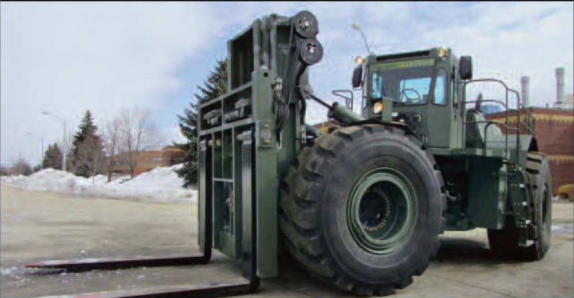
LK67C | Diesel, 4WD, Articulating 30,000 – 67,000 lbs (13,610 – 30,390 kg)

The LK67C is the largest 4WD articulating forklift in the world. Full electronic controls and redundant safety systems ensure maximum productivity.