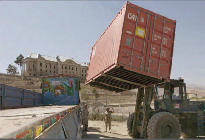
LK20C | Diesel, 4WD, 4WS

The LK20C is a rugged air transportable forklift with a hydraulic spreader or fixed handler and water-fording capability of up to 5 ft. (1.5 m).