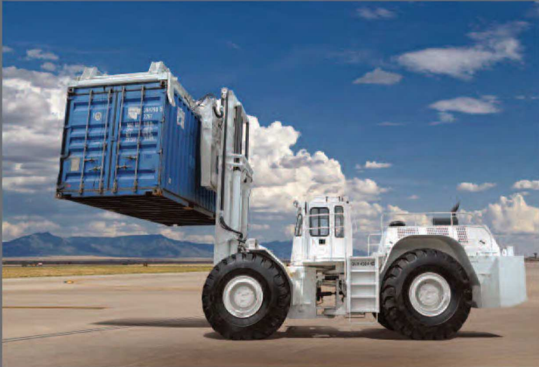
LK50C | Diesel, 4WD, Articulating

The LK50C, with hydraulic spreader or fixed handler, can stack containers 3-high and has water-fording capability of up to 5 ft. (1.5 m).