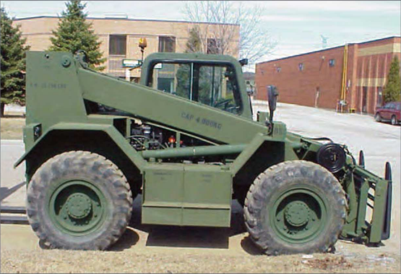
LK934 | Telescopic Boom, 4WD, 4WS

High-mount boom allows maximum visibility when carrying loads. Centrally placed engine offers maximum stability and traction over rough terrain.