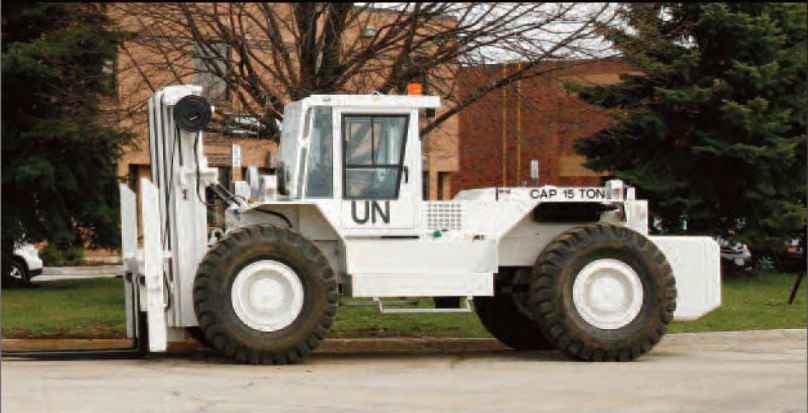
LK15T | Diesel, 4WD, 4WS 20,000 – 33,000 lbs (9,070 – 15,000 kg)

3 cab style options (low, mid, high) allows customer to choose between low profile accessibility and high profile visibility and comfort.