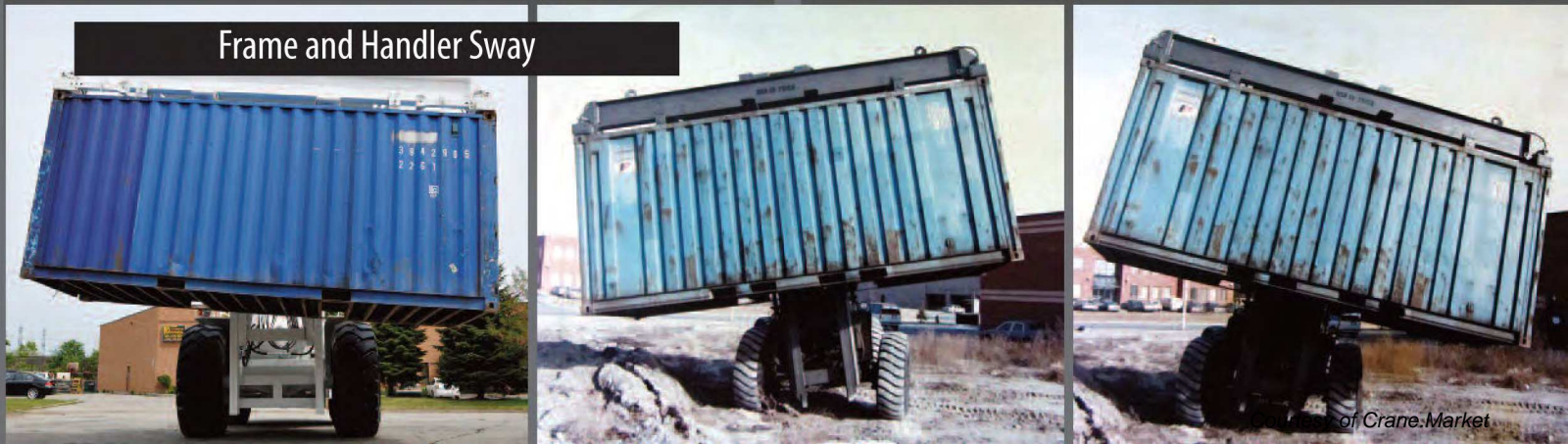
Frame and Handler Sway