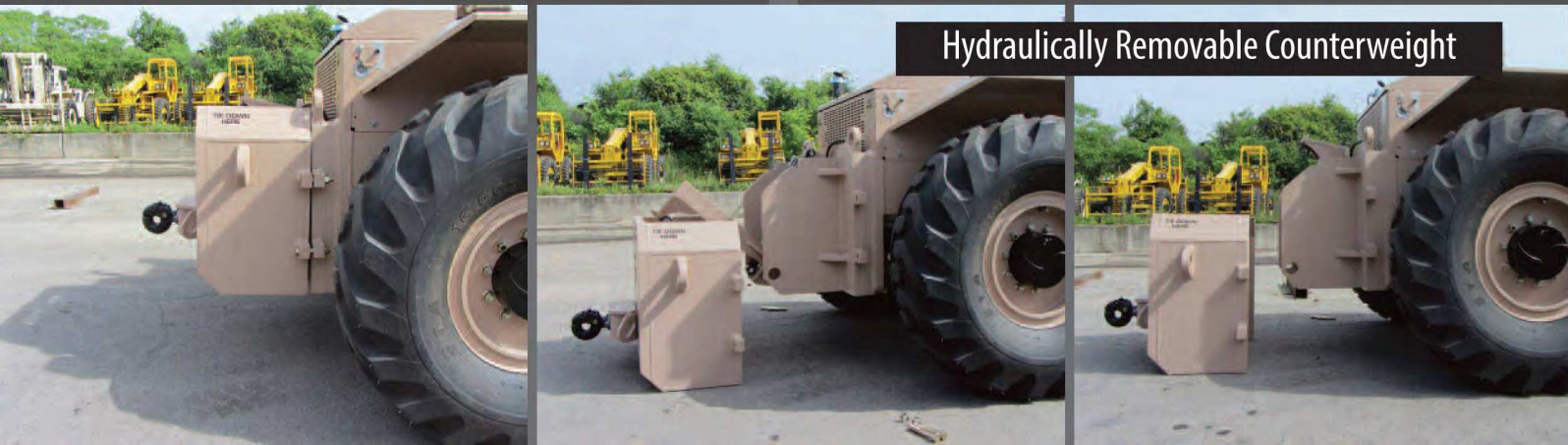
Hydraulically Removable Counterweight