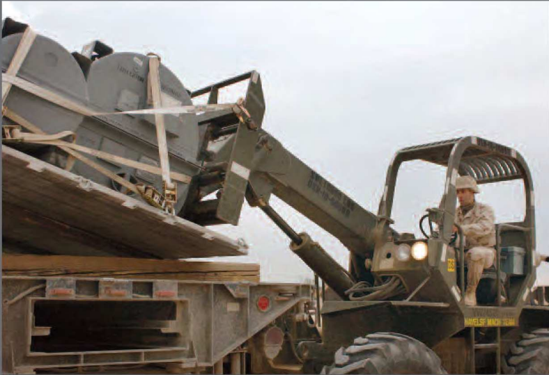
LKSB10K | Fixed Boom, 4WD, 4WS

Open cab provides 360 degree visibility. Frame sway and water-fording of up to 5 ft. (1.5 m) allows operation in all terrain types.