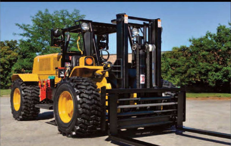
LK8C | Diesel, 4WD, 4WS, DS Rated 4,000 – 12,000 lbs (1,815 – 5,445 kg)

Compact dimensions and low profile design offers maximum versatility and capability in tight quarters. Tight turning radius enhances maneuverability.