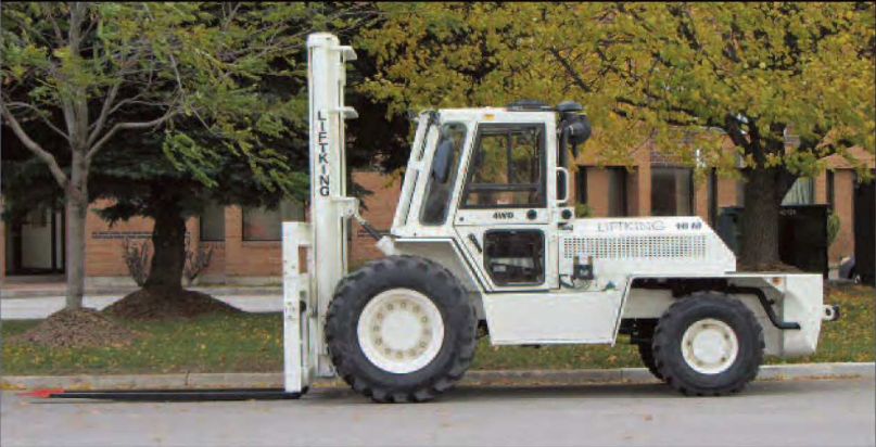
LK16M42 | Diesel, 4WD, 4WS 6,000 – 20,000 lbs (2,720 – 9,070 kg)

Multitude of mast and carriage options offer high versatility to suit any application. Spacious cabin with split doors emphasize operator comfort.