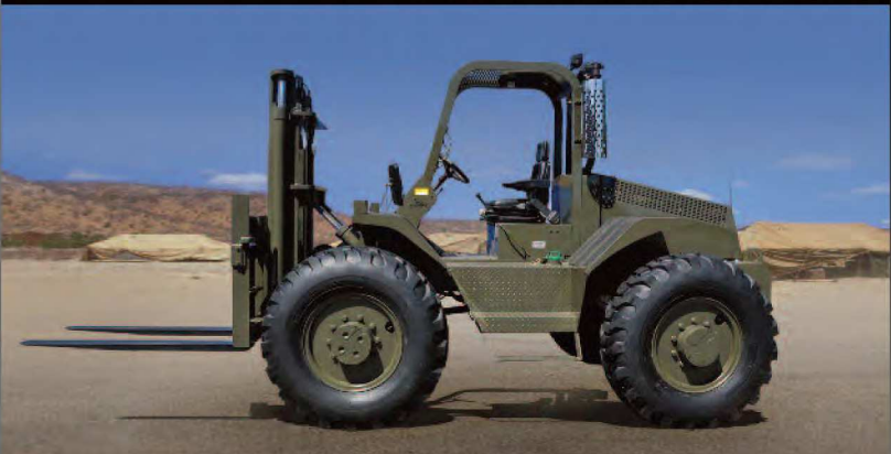
LK10P44 | Diesel, 4WD, 4WS, DS Rated 6,000 – 16,000 lbs (2,720 – 7,265 kg)

The LK10P44 is a compact air transportable forklift with an open cab, engineered for rough terrain and water-fording of up to 3 ft. (1 m).