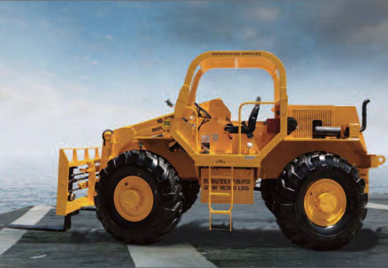
LKSB6K | Fixed Boom, 4WD, 4WS

High seating position and no front overhang provides excellent visibility of loads. The LKSB6K also offers water-fording of up to 5 ft. (1.5 m).