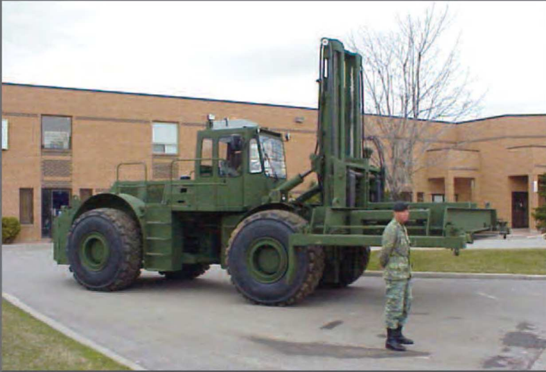
LK35C | Diesel, 4WD, Articulating

The LK35C employs a compact design that enhances maneuverability and efficiency. Full electronic controls ease operation and increase comfort.