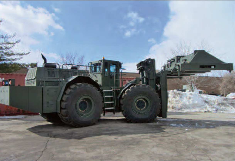
LK67C | Diesel, 4WD, Articulating

The LK67C is the largest 4WD articulating container handler in the world. Full electronic controls and redundant safety systems ensure maximum productivity.