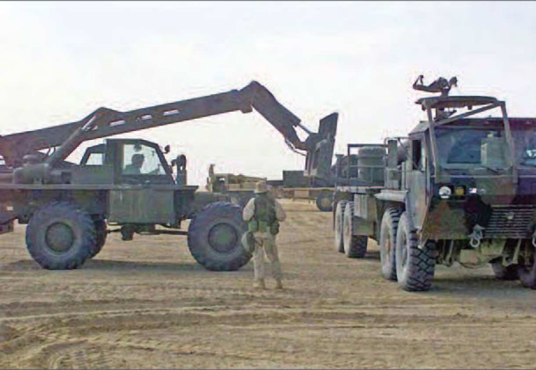
LK150R | Traversing Telescopic Boom

Traversing boom allows precise, incremental placement of load. 4WD and 4WS offer maximum maneuverability.