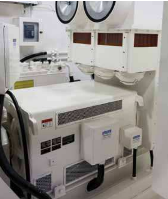
A reliable P&H AC Main Motor is housed within the 320XPC's spacious machinery house.