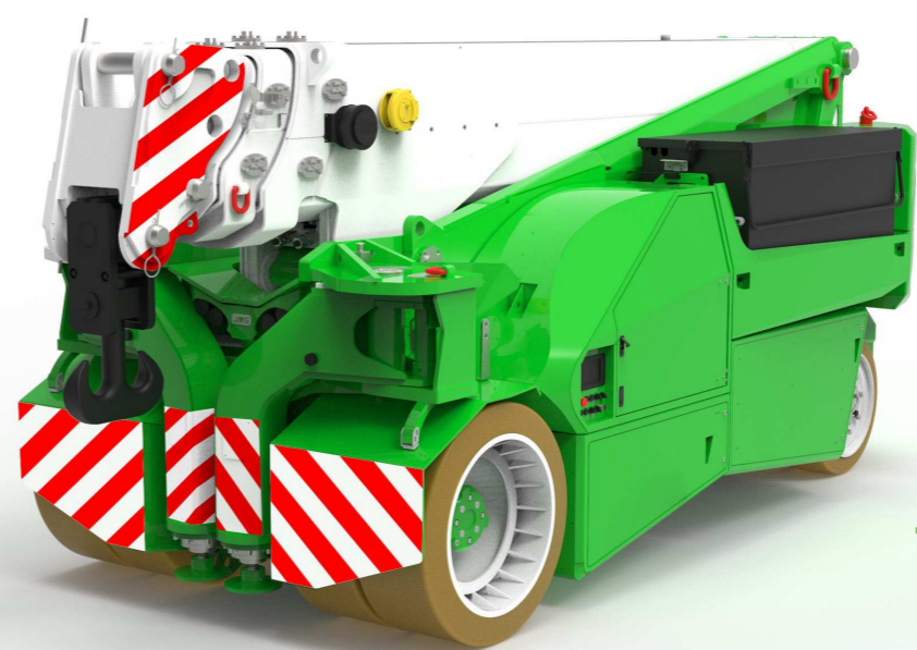
MC 580S (inch) Max Capacity 127,800 lb