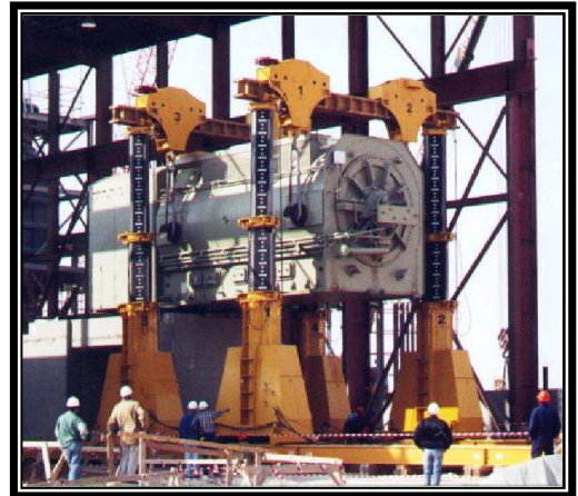
J&R 1402-4-39 Octagon LIFT-N-LOCK Hydraulic Boom Gantry with 150 Ton PowerLinks on a project in Riyadh, Saudia Arabia