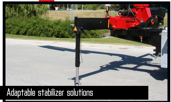
Adaptable stabilizer solutions

A well-known and usual hose routing to the end of the extensions means that 1 or 2 extra valves are fed in sturdy hose guides alongside the jib extension system. If further efficient protection of the hoses is required, 1 or 2 extra valves can be fed in internal hose reels and lie particularly well protected.