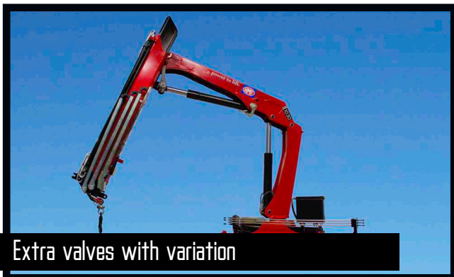
Extra valves with variation

A well-known and usual hose routing to the end of the extensions means that 1 or 2 extra valves are fed in sturdy hose guides alongside the jib extension system. If further efficient protection of the hoses is required, 1 or 2 extra valves can be fed in internal hose reels and lie particularly well protected.