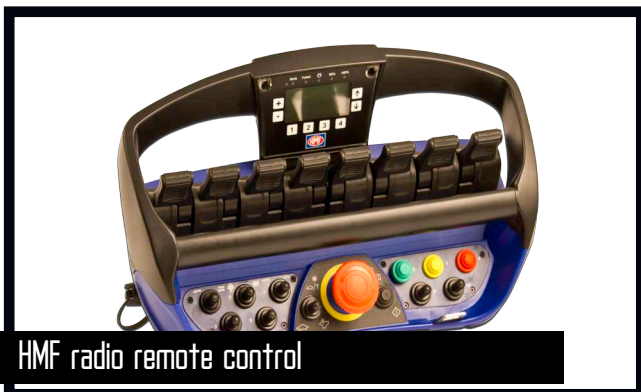
HMF radio remote control

The stabilizer legs of the crane are to ensure stability - however they still have to be sturdy, easy to handle and must not take up too much space when not in use. Therefore you can choose between fixed stabilizer legs, manual swing-up stabilizer legs to 30/60° or manual swing-up stabilizer legs to 180° with gas spring. Stabilizer beams can be freely selected as hydraulically extensible or manually extensible, also in connection with the sophisticated EVS stability monitoring.