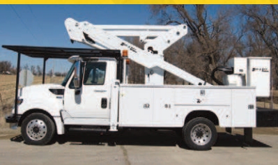
DTAX-44 SHOWN WITH 11' BODY.

Working heights up to 49 FEET AND SIDE REACH UP TO 30'