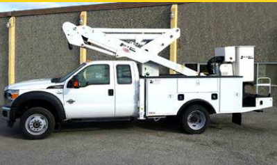
DTAX-42 SHOWN WITH 9' BODY.