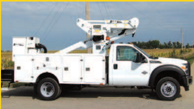
DTAX-39 SHOWN WITH 11' BODY.