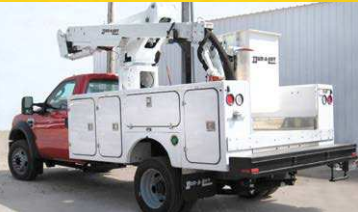
DTA-40 SHOWN WITH 11' BODY.

DTA-38 FEATURES SHORTER STOWED LENGTH FOR USE WITH A 9' OR 11' BODY