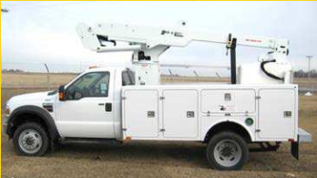
DTA-35 SHOWN WITH 11' BODY.

CATEGORIES D & E NOW AVAILABLE TO MEET NEW ANSI A92.2 STANDARDS