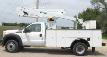
DTA-38 SHOWN WITH 11' BODY.