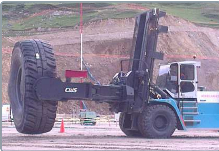
TM40 on a Lift Truck